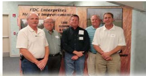
To date the Commonwealth's Piedmont Geriatric Hospital is the only facility in America utilizing SG as their primary fuel source.